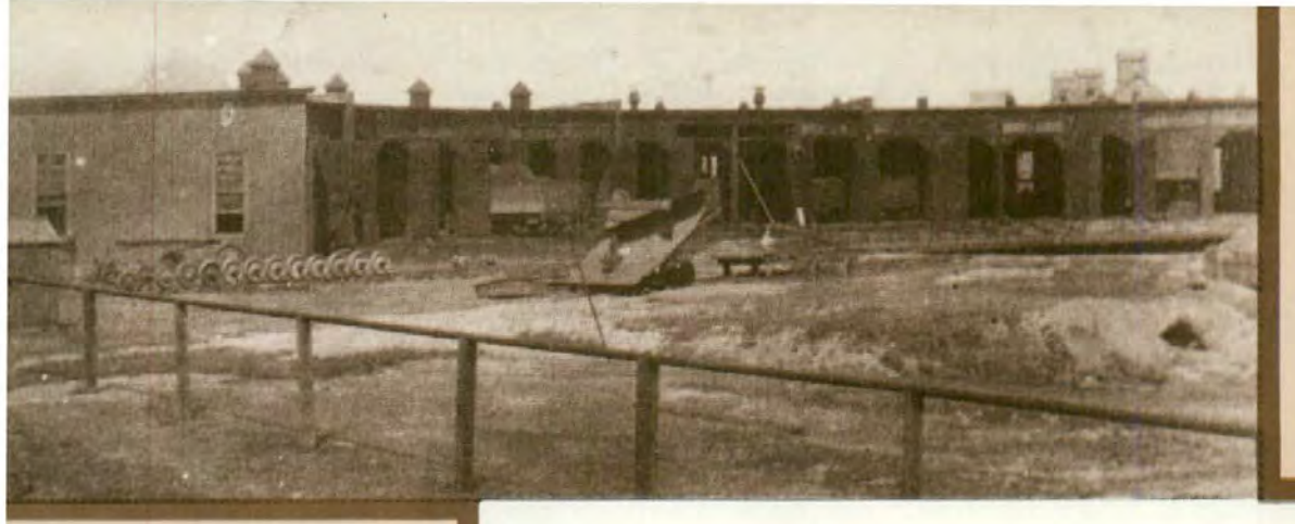
The Enderlin Roundhouse, about 1920