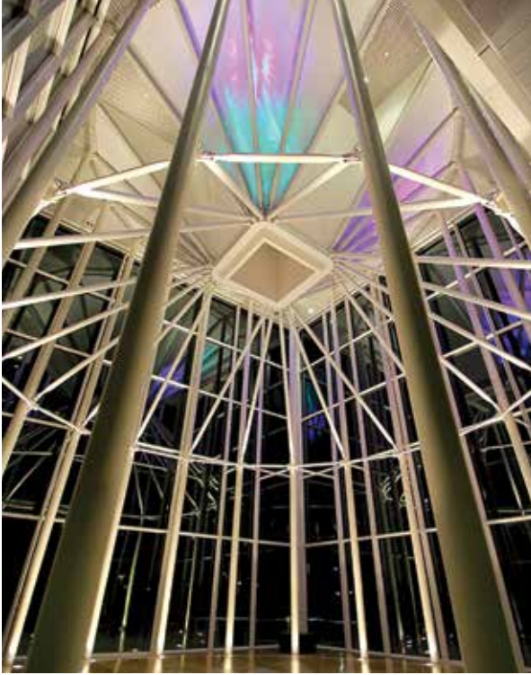
Northern Lights Atrium