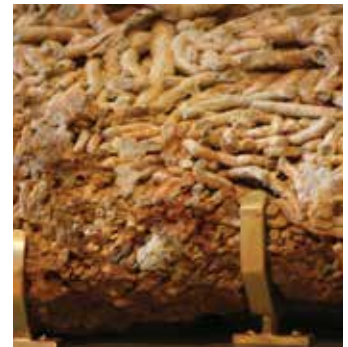
Touch North Dakota's state fossil, Teredo -bored petrified wood.

Become immersed in the underwater world of 80 million years ago, when North Dakota was covered by an ocean. Touch an interactive table to explore a timeline of geological changes in North Dakota from 600 million years ago to the present. View life-size casts of a Tyrannosaurus rex and a Triceratops . Discover what the glaciers left behind.