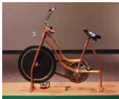
This version of "Green Revolution" is based on an exhibition originally created by the Museum of Science and Industry, Chicago, and its Black Creativity Council and is made available by the Smithsonian Institution Traveling Exhibition Service.

This gallery hosts temporary and traveling exhibits. Tour our free current exhibit - the Green Revolution ! Explore how you and your family can be more eco-friendly with a new Smithsonian eco-zibit, made from recycled and repurposed materials. Green Revolution focuses on important environmental issues such as alternative energy sources, green building, recycling, and waste management.