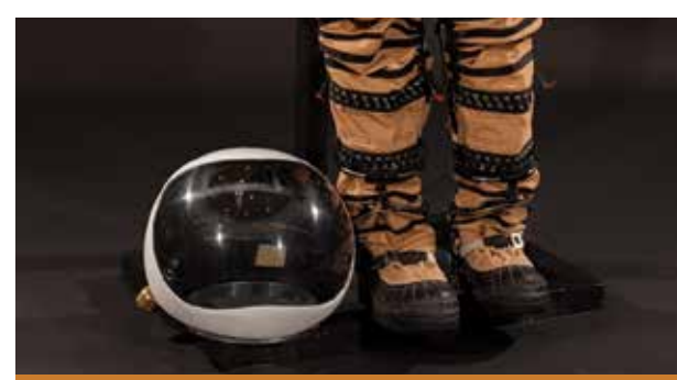
INSPIRATION GALLERY: YESTERDAY AND TODAY