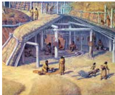
A hand-painted mural of a Mandan Indian village (Double Ditch Indian Village State Historic Site) at A.D. 1550.

The story of the Early Peoples began more than 13,000 years ago. This gallery features archaeological artifacts from prehistoric cultures, the international story of the fur trade, oral histories, a handpainted cyclorama, and more treasures spanning through the 1860s.