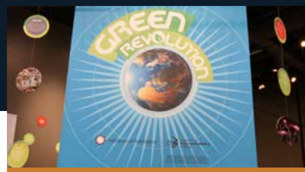
GOVERNORS GALLERY (TRAVELING EXHIBITS)