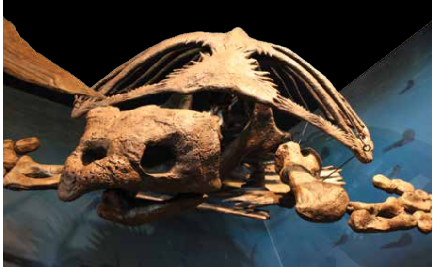
Archelon was the largest prehistoric turtle — about the size and shape of a classic Volkswagen Beetle.