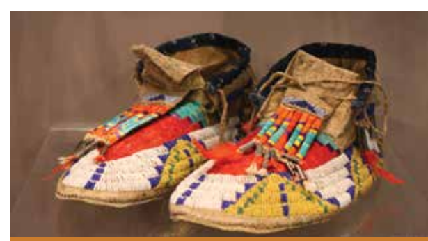
INNOVATION GALLERY: EARLY PEOPLES