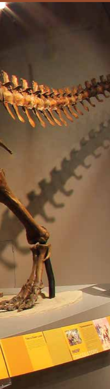
Meet our roaring Tyrannosaurus Rex , 35 feet in length.