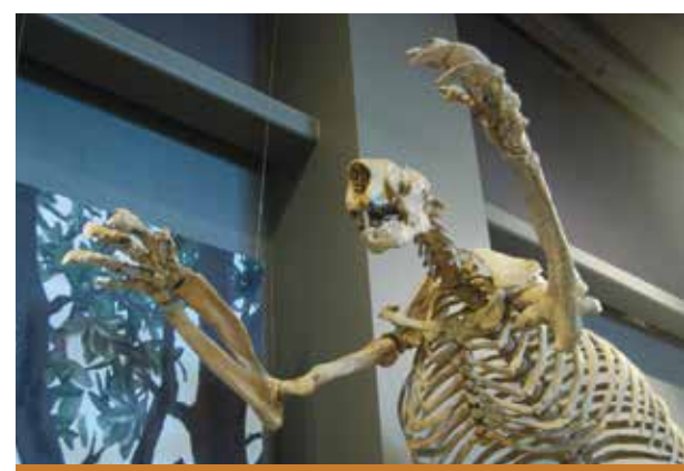
ADAPTATION GALLERY: GEOLOGIC TIME