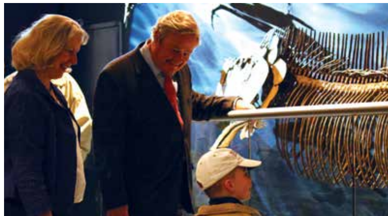
Governor Jack and First Lady Betsy Dalrymple are regular visitors to the North Dakota Heritage Center & State Museum.