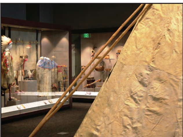
Devoted to the earliest people of North Dakota, the Innovation Gallery highlights the beauty and breadth of the State Museum's collections.

rich heritage. Many of these paintings are based on archaeological investigations at these sites.