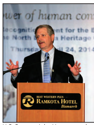
U.S. Senator John Hoeven made a special effort to give the welcome for this recognition event.