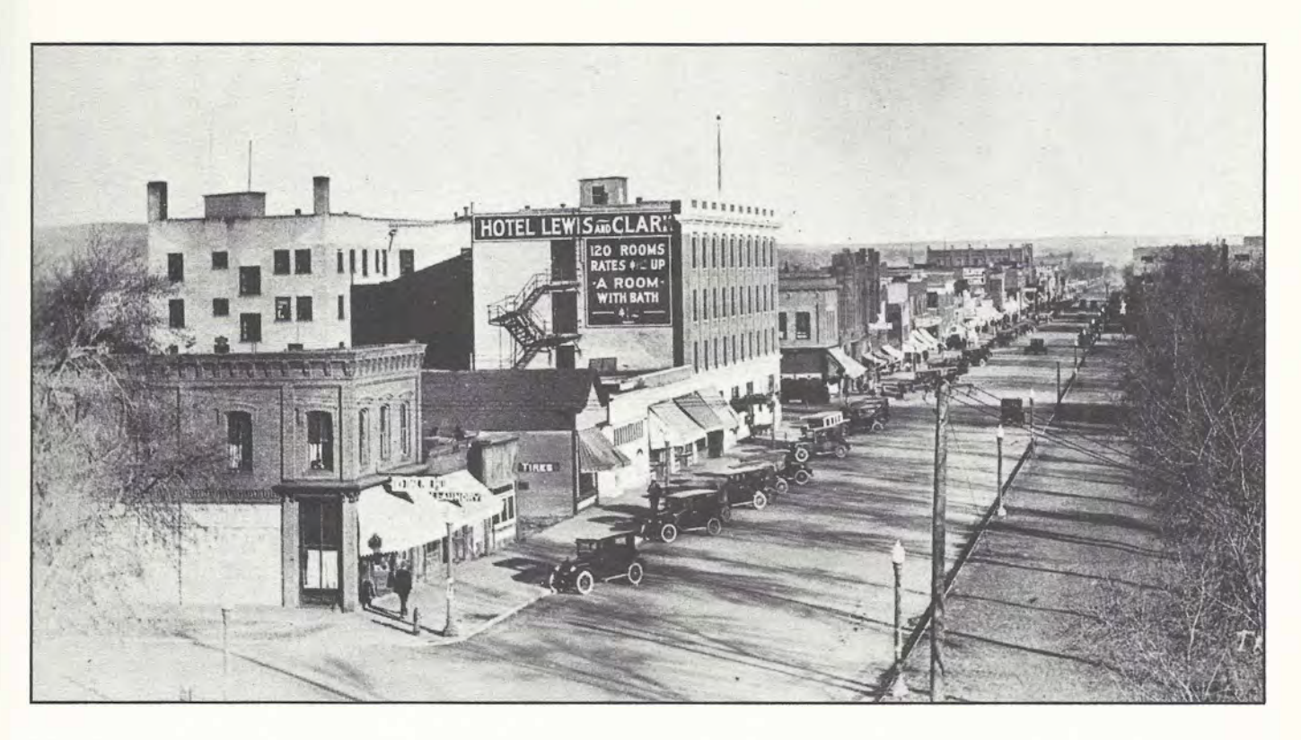
Main Street in Mandan, looking east, December 11, 1923.

cowboys would never have gaped at a woman like that. Besides, those diners didn't even look like cowboys. I took a swallow or two of coffee and left. From then on, I was careful to get my directions right.