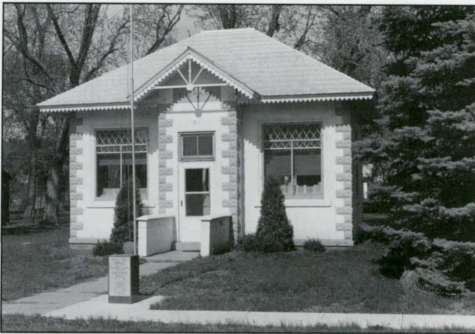
Watt's Free Library in Leonard. Unlike many of his contemporaries, library benefactor Edgerton Watts of Leonard could not draw upon great wealth. This modest one-room Victorian cottage was donated with monies from his salary as local postmaster.

contemporaries, Watts had few assets apart from small land holdings within Leonard and his income as postmaster. His tiny, single room namesake built in 1911 is composed of rock-faced concrete blocks and features a roof of scalloped metal shingles and eaves trimmed with cut wood trim. Undisputedly the most modest subject in the state's inventory of libraries, this small building makes vestigial reference to the much earlier Stick style through the use of a decorative truss in the entry gable.