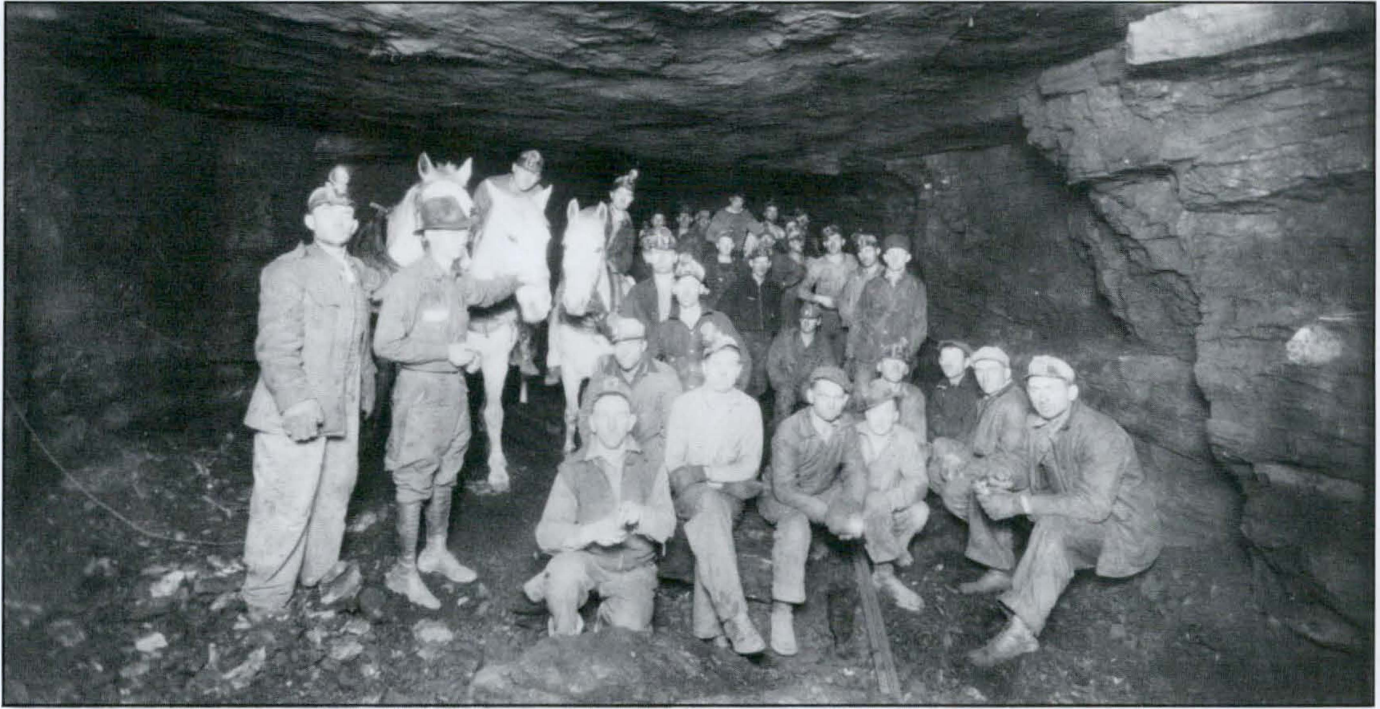
Coal miners and horses from the Washburn Lignite Coal Company's Wilton mine in an underground chamber. This photograph appeared in the Fargo Record (1901). While the Washburn mine had electric power, other underground mining operations relied solely upon horses or mules to haul carloads of coal.

effectively ended, although the state would still have dealings with mine operators whose property had been seized.