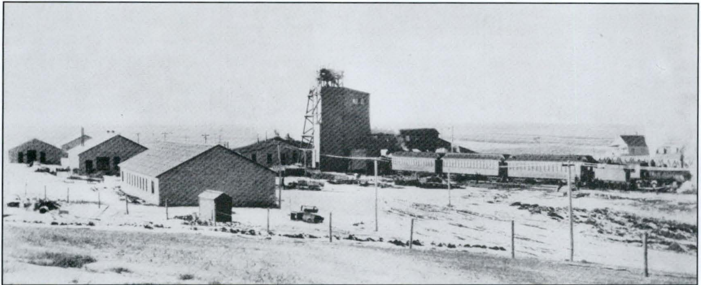
This photograph of the Washburn Lignite Coal Company appeared in an ad on the front page of a special edition of the Business Bulletin , devoted to coal promotion. The Business Bulletin was published by the Minot Association of Commerce and is dated January 15, 1918.