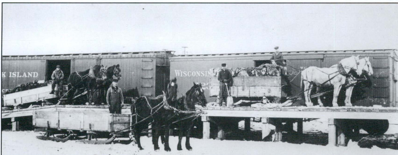
Loading coal at Columbus, North Dakota, 1908. The horse teams are pulling coal sleds.

As Fraser's men closed up shop in the lignite districts, local newspapers responded in much the same way as had the Wilton paper at the return of the Washburn Lignite Coal Company mines. State guardsmen were not only praised as capable mine managers, but were also given warm farewells as if they were departing hometown boys. "Lieutenant