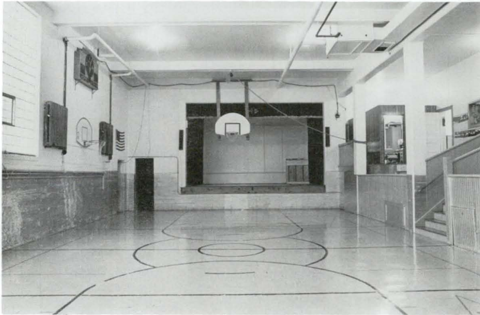
The limited playing facilities at Hurdsfield High School in 1953-1954 determined coaching strategies. Originally, the gymnasium seated 200 spectators. A corner office pictured in this photograph of the present building has been added and windows and a brass bell have been removed.