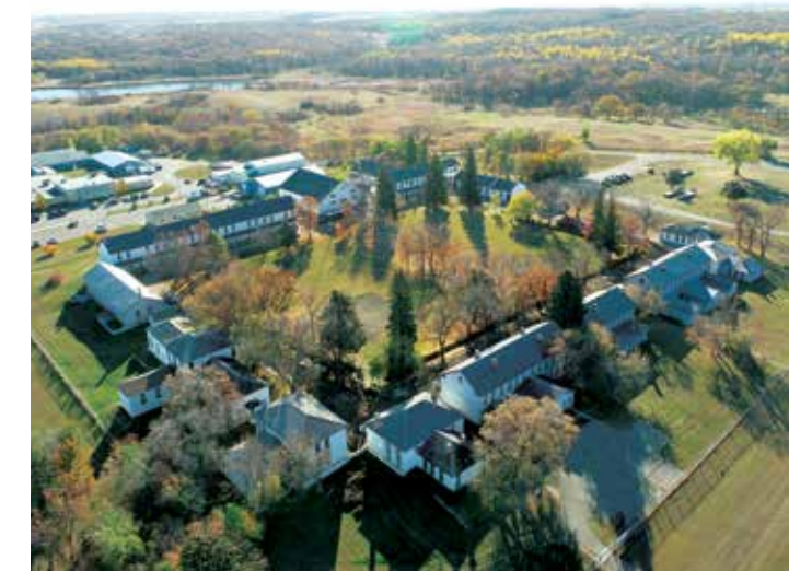
Fort Totten State Historic Site