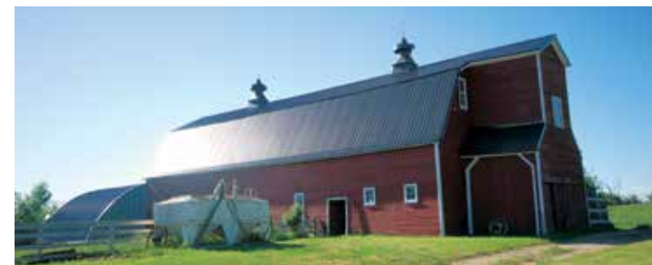
The Schlafmann Barn

The Schlafmann Barn near Turtle Lake was recently listed in the National Register of Historic Places. The National Register is the federal government's list of properties it considers worthy of preservation and recognition. North Dakota nominations are coordinated by the State Historical Society.