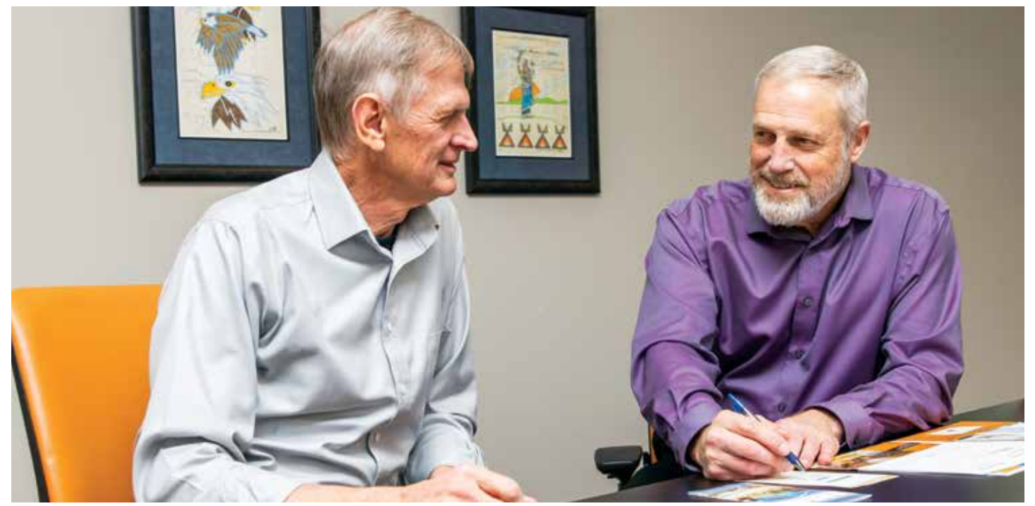
To learn more about how you can support the Foundation, drop by and say hello—we'd love to meet you! Our offices are in the ND Heritage Center & State Museum on the Capitol grounds in Bismarck.

If you are looking for ways to ensure our state's historical legacy, here are three retirement account giving options that can benefit both you and the State Historical Society of North Dakota Foundation.