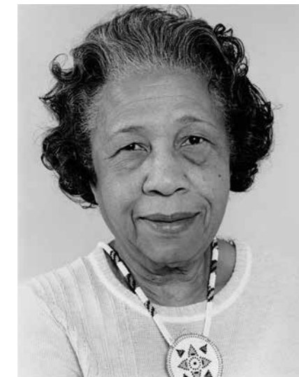
The lives and achievements of nationally renowned journalists Eric Sevareid and Era Bell Thompson are among topics explored in the State Archives' new subject guides. SHSND SA 00018-00063, 00262-00009

More than 70 subject guides have been created for students competing in the National History Day in North Dakota contest. Geared to middle and high school students, these guides include primary and secondary sources, useful search terms, publications, and journal articles held at the State Archives. Partially funded by a grant from the National Historical Publications and Records Commission, the guides can be accessed at history.nd.gov/archives/rsubjectguides.html .