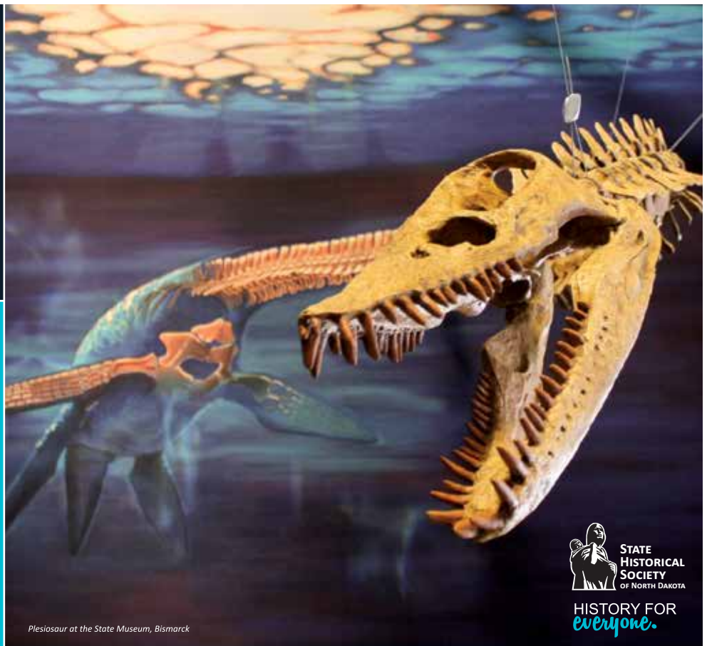
Plesiosaur at the State Museum, Bismarck

Plan a visit today! history.nd.gov/visit