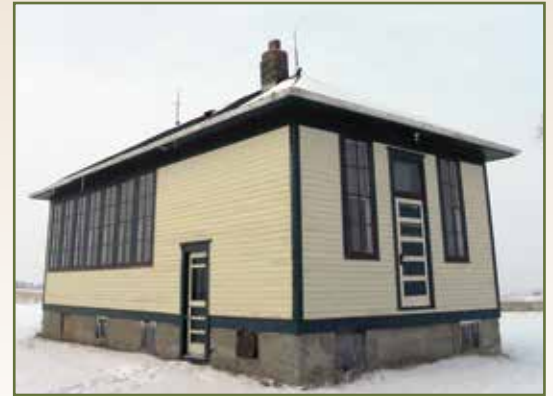
Alderman School District #78