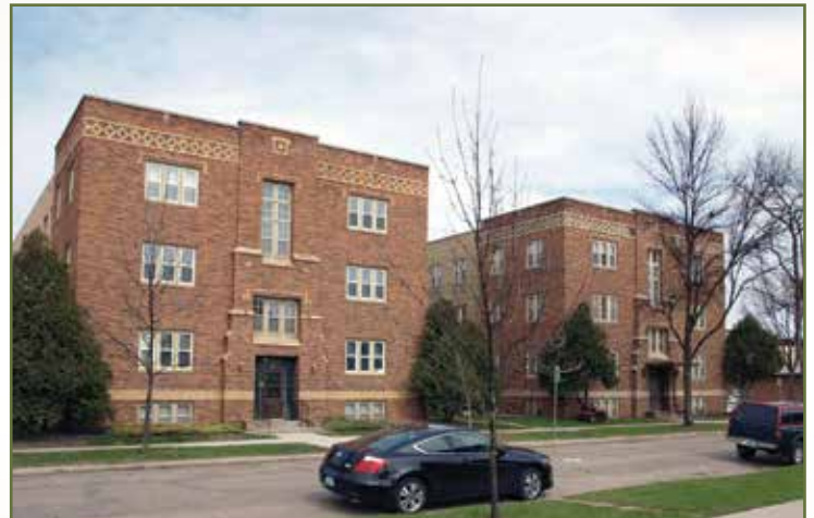
Ambassador and President Apartments