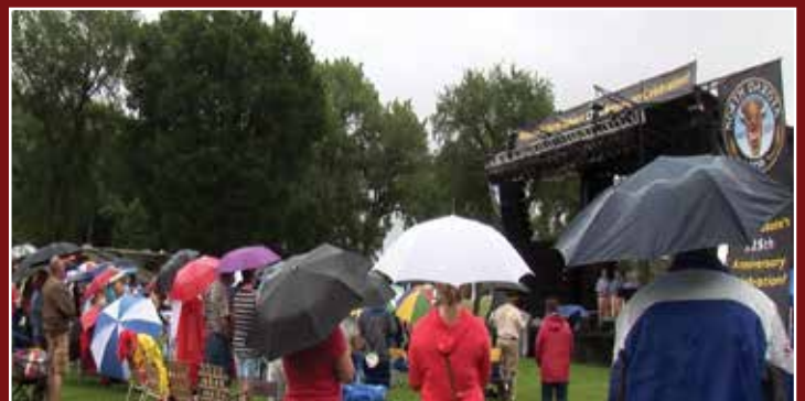
Hardy North Dakotans stayed through the rain for great entertainment on the outdoor stage.