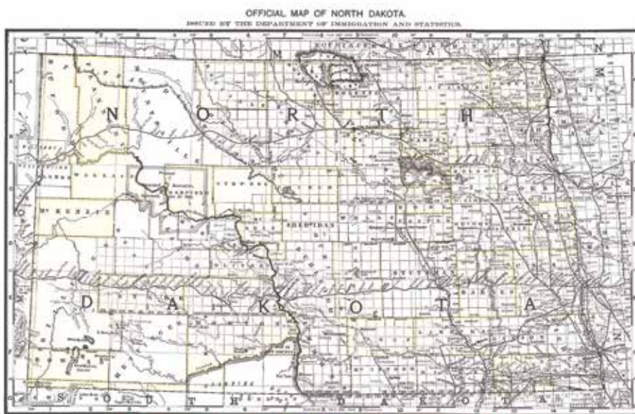
A STATE OF THE UNION, IN 1889, WITH 300,000 PEOPLE | THE LAND OF THE GREAT NORTHWEST ALIEN OF IMMIGRANT LAND FOR SUBSIDIZED, FOR RAILROADS, AND THE OILS. SOURCE: OFFICE OF THE SECRETARY OF AGRICULTURE, BUREAU OF LAND MANAGEMENT, WASHINGTON, D.C. Digitized by the National Historical Geographic Information System, sponsored by the U.S. Department of the Interior, Bureau of Land Management, and the U.S. Department of Commerce, National Oceanic and Atmospheric Administration.

Please come and celebrate North Dakota's 125 years!