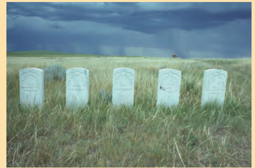
Fort Dilts State Historic Site is one of several areas impacted by the American Civil War. Find out more about the history of this site and its significance at history.nd.gov/historicsites/dilts/ .

Did you know there are five Civil War battlefield sites in North Dakota? This generally comes as a surprise to most residents of the state. No, the Confederate States did not invade Dakota Territory, but the US Army did use resources and troops to battle with the Dakota or Sioux people to drive them west out of Dakota Territory. This was in response to the US Dakota War in Minnesota in 1862. In 1864, Gen. Alfred Sully made an expedition into western Dakota Territory and fought with the Sioux near Killdeer Mountain. His troops were also involved in the Battle of the Badlands near present day Medora, and at Fort Dilts near present day Rhame and Marmarth.