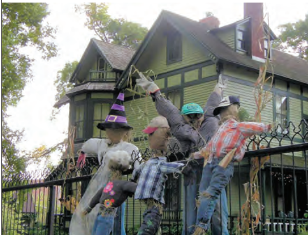
Halloween scarecrows made at the Former Governors' Mansion.