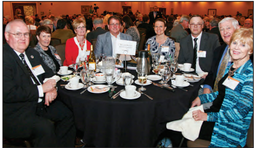
Mountrail-Williams Electric Cooperative members enjoyed great food and conversation.