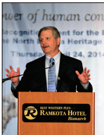
U.S. Senator John Hoeven made a special effort to give the welcome for this recognition event.