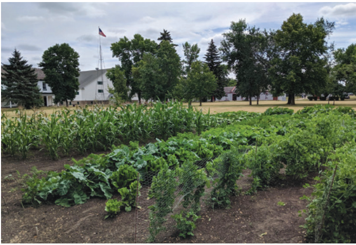
A victory garden planted by staff at Fort Totten State Historic Site produced some 600 pounds of produce for the Hope Center food bank.