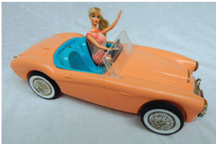
Barbie is a favorite of survey respondents.

Barbies? Bell bottoms? Board games? What items from your childhood and beyond would you most like to see included in a future exhibit?