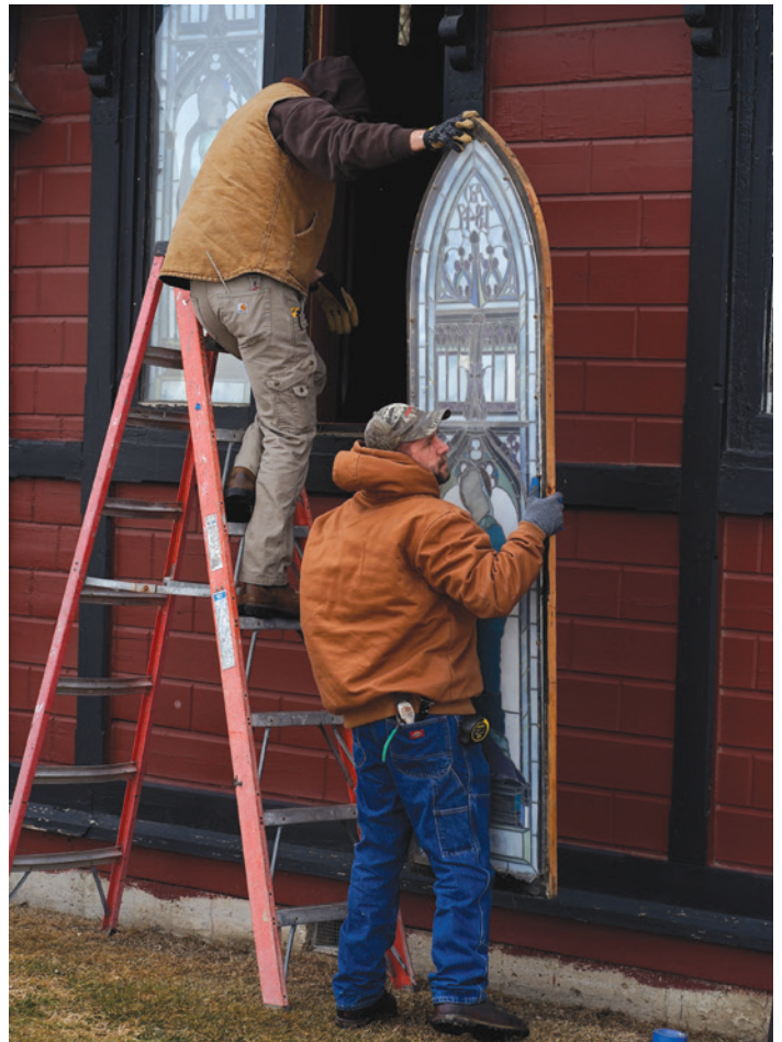
Conservators carefully remove the Leah F. Parkhurst Memorial Windows at Camp Hancock State Historic Site's Bread of Life Church for restoration. The windows were made in 1882 by prominent stained-glass designer John La Farge.