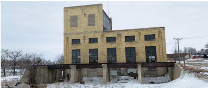
The Harvey Power Plant

Famed Bauhaus architect Marcel Breuer’s Our Lady of the Annunciation Chapel at the University of Mary in Bismarck was among the new additions to the National Register of Historic Places in 2020. Dubbed his “jewel on the prairie,” Breuer’s modernist chapel, completed in 1963, features varied materials for texture, colored glass, and locally sourced fieldstone. Other additions to the register this year include half a dozen mid-20th century Grand Forks school buildings and Harvey’s first and only substantial electrical power generation facility.