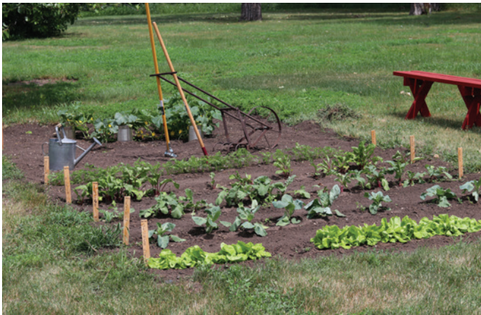
Staff planted a Gemüsegarten (vegetable garden) at Welk Homestead State Historic Site, complete with markers in both German and English.