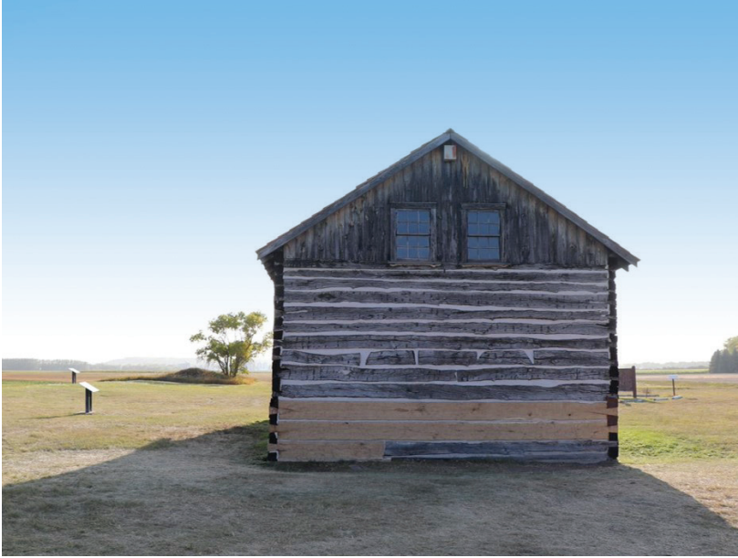
The Gingras Trading Post near Walhalla received new logs to restore structural integrity.

While much of the world shut down this year, staff, volunteers, and other workers have been busier than ever at our state historic sites, which saw a banner year for capital improvements and other much-needed maintenance and upkeep. From new coats of paint to log replacement to garden planting, here are a few examples of DIY in action.