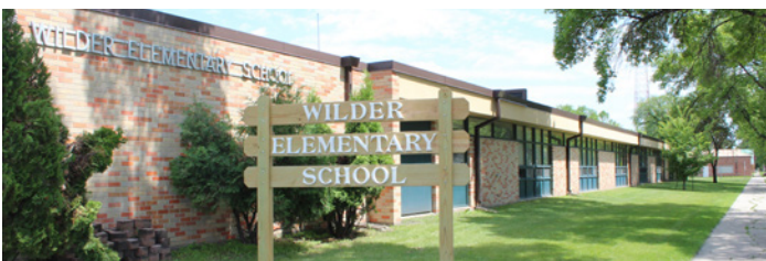
Wilder Elementary School

The Harvey Power Plant provided electrical power to Harvey and much of Wells County for 24 years before its closure in 1954 when the consolidation of electricity production facilities and the construction of larger power plants nearby made it obsolete.