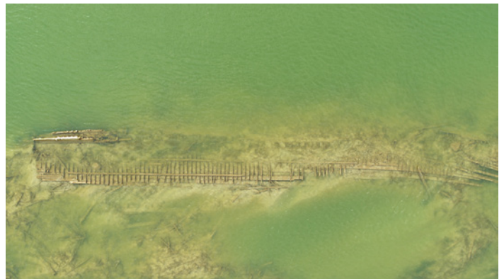
High-resolution drone photos allow archaeologists to measure the width of individual beams in the hull.

Capturing high-resolution drone footage is critical to assessing the wreck's current state of preservation and will be used to help update the state's records on the site, said Reed. The Abner O'Neal wreck is one of seven archaeological sites that the division has mapped to date using drones.