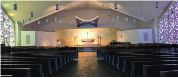
Our Lady of the Annunciation Chapel

Famed Bauhaus architect Marcel Breuer’s Our Lady of the Annunciation Chapel at the University of Mary in Bismarck was among the new additions to the National Register of Historic Places in 2020. Dubbed his “jewel on the prairie,” Breuer’s modernist chapel, completed in 1963, features varied materials for texture, colored glass, and locally sourced fieldstone. Other additions to the register this year include half a dozen mid-20th century Grand Forks school buildings and Harvey’s first and only substantial electrical power generation facility.