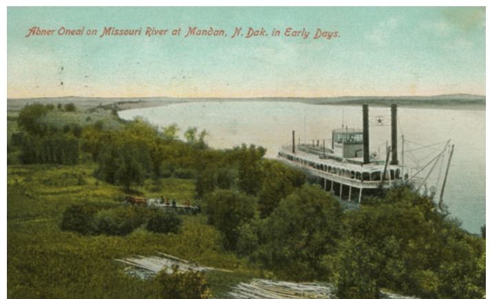
The Abner O'Neal steamboat in its 19th-century heyday.