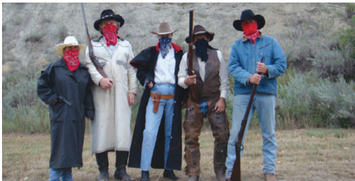
Visitors to the Chateau were "held up" by some shady characters.

Visitors to Chateau de Morès State Historic Site in Medora enjoyed a spooky treat this Halloween. The Chateau invited guests on a spine-tingling wagon ride past the site's historic buildings, across the Little Missouri River, and through Chimney Park and the ruins of the abattoir (slaughterhouse). Along the way, ghostly apparitions and scary shenanigans by a gang of outlaws abounded.