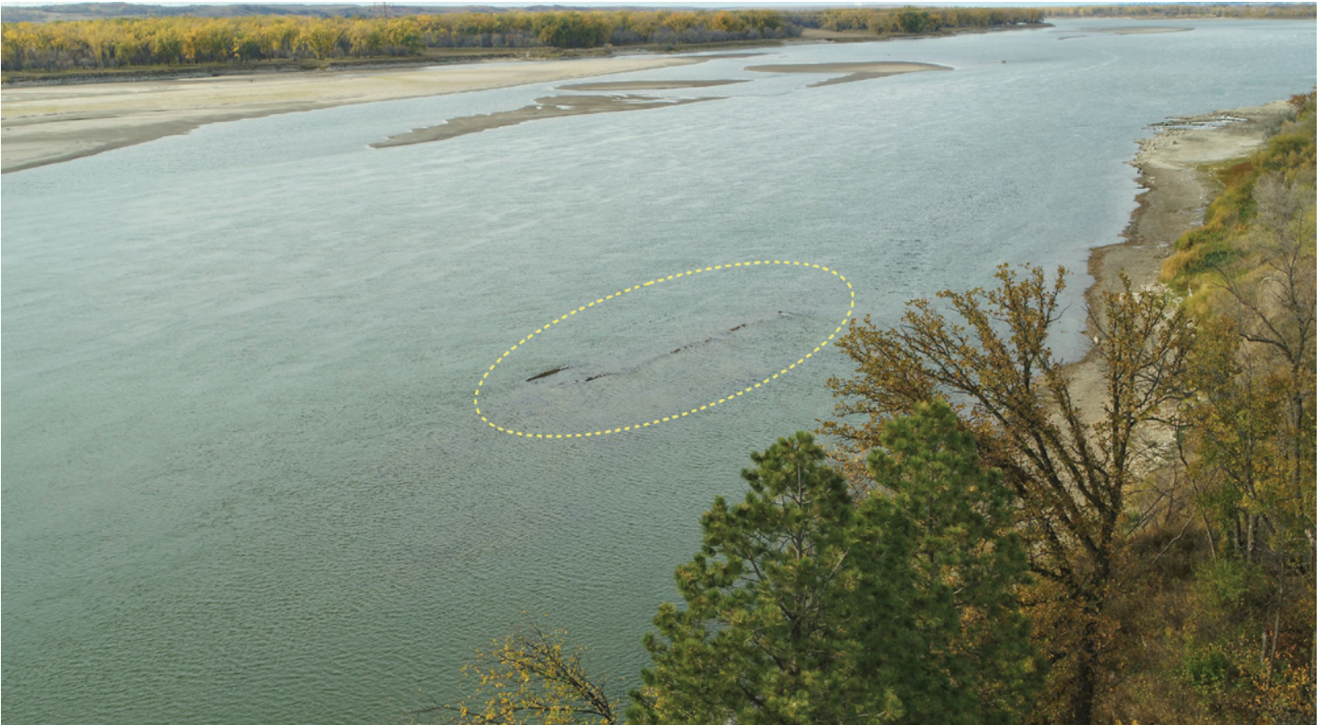
Aerial footage near the confluence of the Painted Woods Creek and the Missouri River, where the steamboat sank.

Team members from the Archaeology & Historic Preservation Division took advantage of the Missouri River's low water levels this fall to capture some truly out-of-this-world footage of the wreck of the Abner O'Neal, a 19th-century steamboat, which sank in July 1892 while ferrying wheat between Washburn and Mandan.