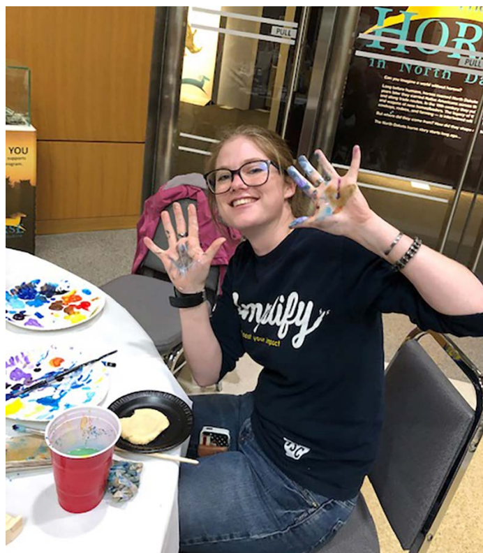
Participants in “Canvas and Cocktails: Painting Horses” show off their completed work and the creative process.