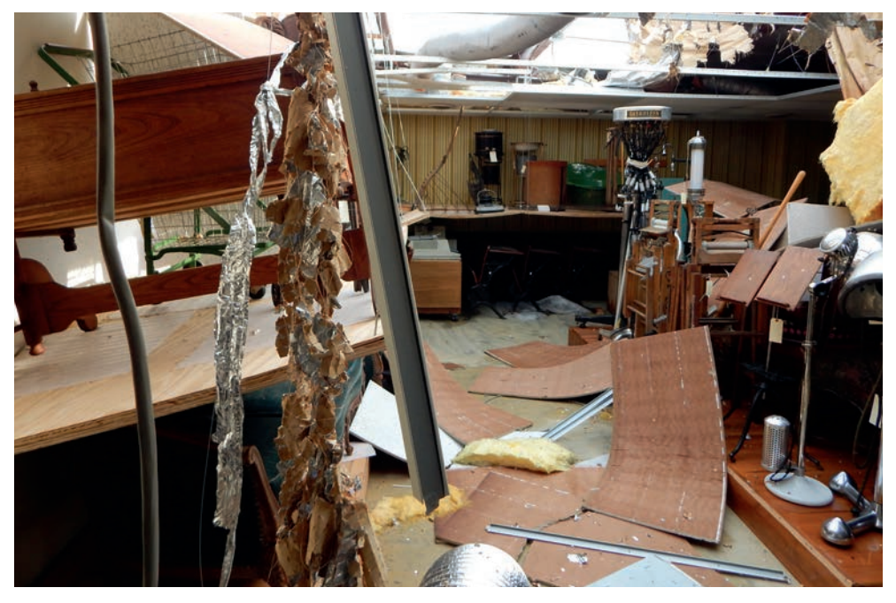
Stored museum collection artifacts were exposed to the elements following a severe storm on June 28.

On Thursday, June 28, the State Historical Society's Artifact Storage East in Bismarck, which houses furniture and large items from the museum collection, sustained severe storm damage. A section of the roof was torn off the twostory building, and a trailer at the site flipped over. State Historical Society staff immediately put our emergency response plan into action. Museum Division personnel spent the following day cleaning up the mess, removing water, and handling artifacts that needed to be dried, as well as contacting insurance companies, ordering a dumpster for debris, and finding a contractor to repair the roof. Staff did an excellent job responding to this emergency.