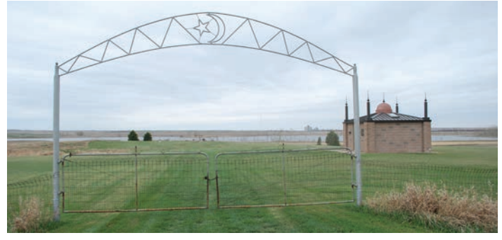
The Assyrian Muslim Cemetery near Ross is the site of the first mosque in the nation and was the only Muslim cemetery in North Dakota for 90 years.

Five North Dakota properties have been listed in the National Register of Historic Places, the federal government's list of properties it considers worthy of preservation and recognition: the Assyrian Muslim Cemetery; Burke County World War Memorial Hall; Dease-Martineau House, Trading Post, and Oxcart Trail Historic District; Manfred Historic District; and Robinson Hall.