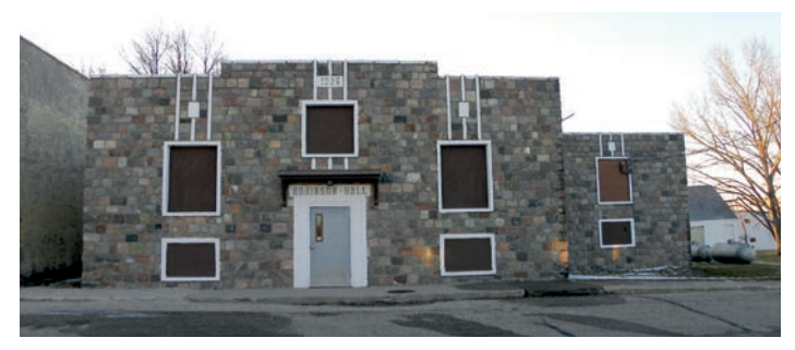
Robinson Hall began as a Works Progress Administration project in 1936, with additions built in 1942 and 1983. This hall is significant for its major role in the social history of Robinson.