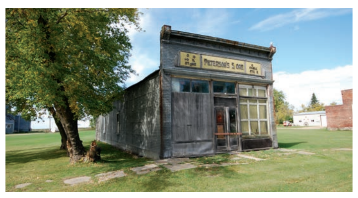
The village of Manfred in Wells County was nominated as the Manfred Historic District because it is an excellent example of an agricultural town that showcases both the rise and decline of rural towns across the state.