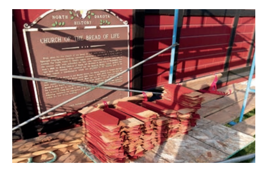
Contractors replaced the 30-year-old roof on Camp Hancock's Bread of Life Church with new cedar shingles, many of which needed to be cut and stained red by hand.