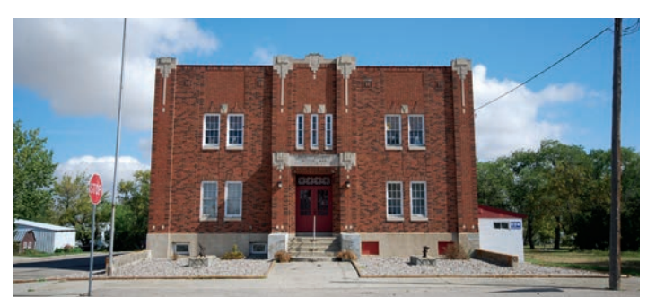
Burke County World War Memorial Hall in Flaxton, dedicated in 1931, still houses government offices, community groups, and events.