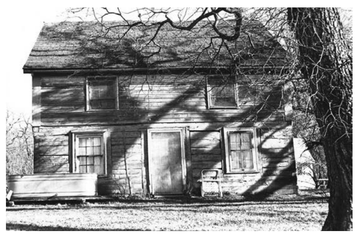
The Dease-Martineau House, Trading Post, and Oxcart Trail Historic District near Leroy has log buildings built using Red River construction techniques and includes segments of oxcart trails.